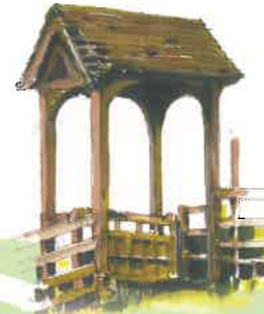
Lychgate at Asgarby Church