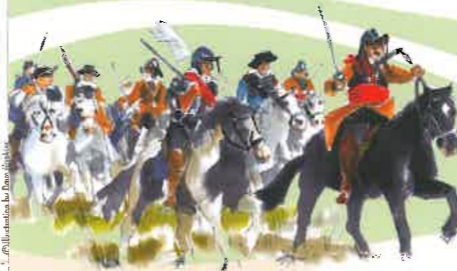
A re-enactment of the Battle of Winceby

An information board in the lay-by on the B1195 to the north-west of Winceby village describes the Battle of Winceby.