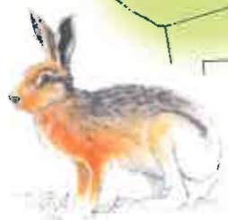
Hares and rabbits are a common sight along the walk.

Lincolnshire County Council reproduced from OS mapping with the permission of The Controller of HMSO © Crown Copyright. Unauthorised reproduction infringes Crown Copyright and may lead to civil proceedings OS licence 100025370.