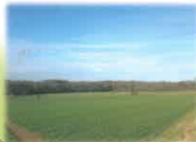
View toward Slash Hollow

The remains of medieval farming in the form of crofts and ridge and furrow are recorded nearby, and from this point there is a good view north-west across Slash Hollow where the Battle of Winceby reached its bloody conclusion in October 1643.